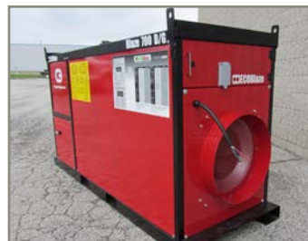
Skid Mounted LPNG or Diesel Heaters EB700D/G, EB1000D/G, EB2000D/G

Campo Equipment 6 Carson Ct – Brampton, Ontario Canada – L6T 4P8