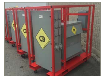
Temporary Portable Power Distribution and Breaker Panels