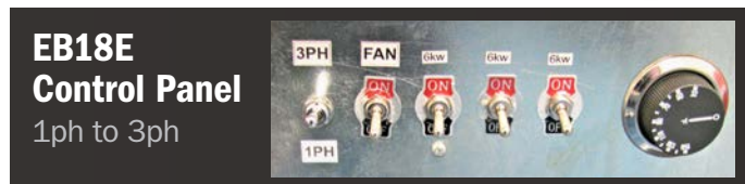
EB18E Control Panel 1ph to 3ph