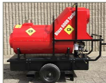
Cart-mount Indirect Fired Heaters Available in Oil/Diesel Fired or LPNG From 200K to 600K BTU