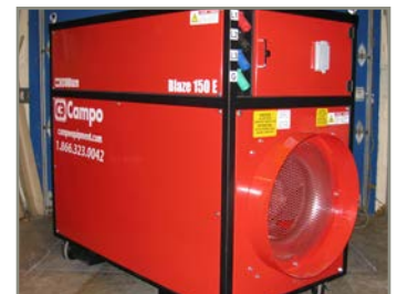
Skid/Caster Mount Electric Heaters Blaze 60KW and Blaze 150KW