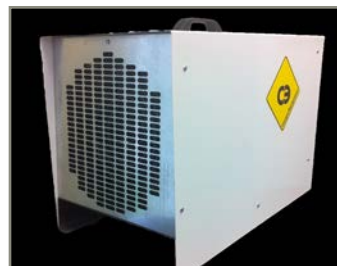
Hand Carry Electric Heaters Blaze 1.5E, 3E, 6/9E, 18E