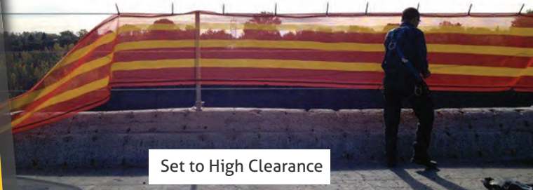
Set to High Clearance