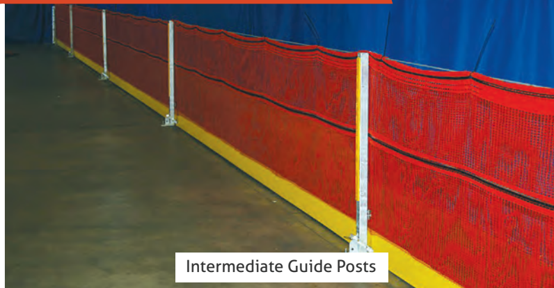
Intermediate Guide Posts